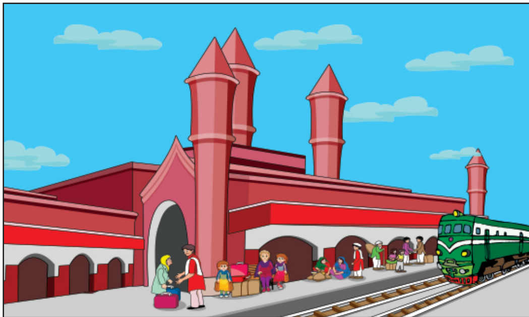
Train stops at the railway station.