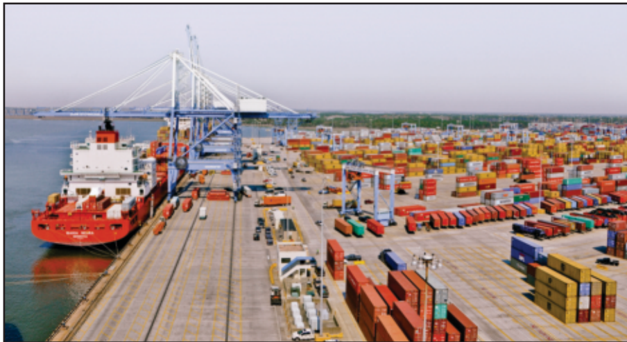
Ships arrive at the harbour.