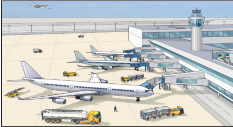
Aeroplanes fly and land at the airport.